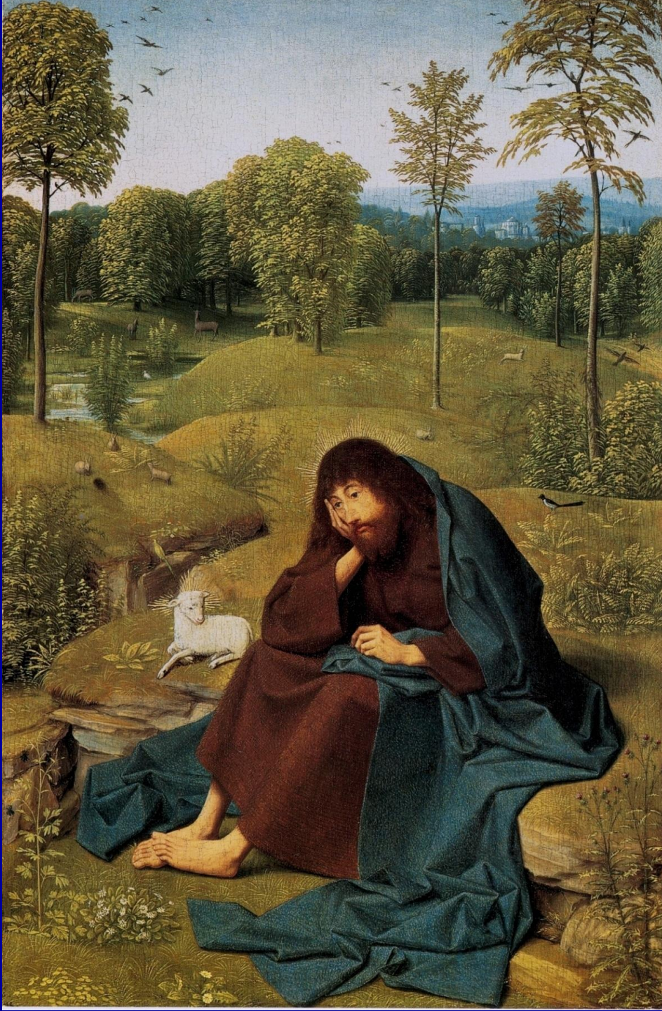
Geertgen tot Sint Jans (1490): St. John meditating